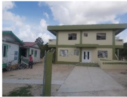
Image showing Belmopan, Caye Caulker and Crooked Tree Health Facilities- newly built