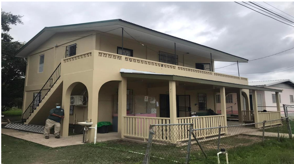
Renovation of Ladyville Health Center "Delivering on #Plan Belize"